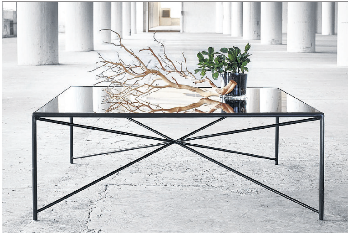
The popular Jax coffee table is made in Atlanta by GREY furniture.

Do you have favorite finds from around the South that you give as gifts, buy for your home or rave about to friends? If so, send your suggestions to: ljerkins@gmail.com . Also find more Southern-made products, featured in the AJC, at Southernfinds on Facebook or twitter@southernfinds .