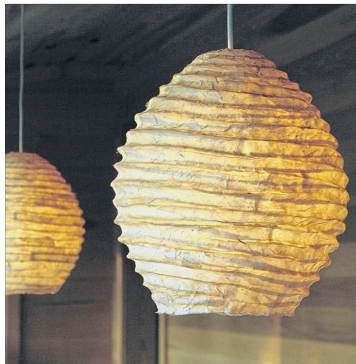
Virginia artist creates light sculptures for residential and commercial lighting.